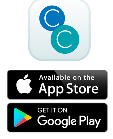
Download MyCareCorner in your app store

1.) Once you receive an email to join MyCareCorner, click the link in the email to create your account.